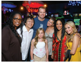
EHF Founders with Heroes Cast & Family

The cast of Heroes and angels alike enjoyed a great afternoon of bowling to support the Elevate Hope Foundation (EHF) and interact with 12 very special honorees from "Vista Del Mar Child & Family Services". It was an awesome experience for each student. Upon arrival, our honorees were escorted to their exclusive VIP room and served lunch, played video games, and were presented special gift bags. Prior to the games, the honorees were introduced to our celebrity guests, received autographs, and had photo ops with each. After the games, the honorees with the top scores were awarded prizes such as a Macintosh Laptop computer, iPod Nano, and more.